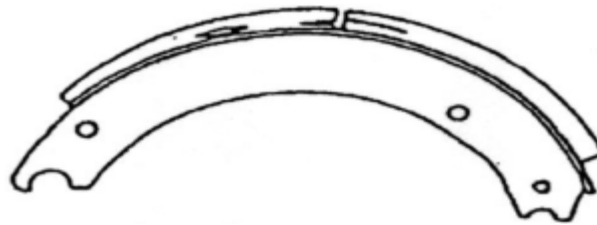
Out-of-Service Cracks or voids that exceed 1/16" in width. Cracks that exceed 1-1/2" in length.