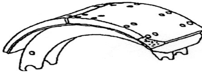
Out-of-Service Portion of lining missing that exposes a fastening device.